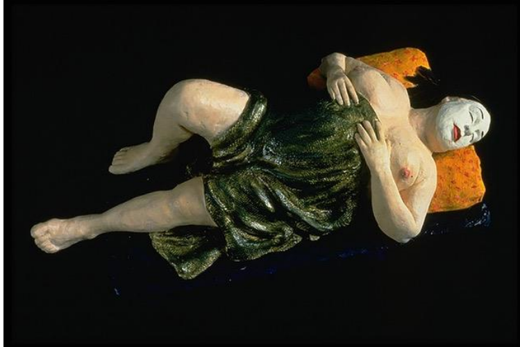
Sarah Katz, Sleeping Bird Woman , 2018 Stoneware with encaustic, paint and feathers, 9.5" x 22" x 7.5"