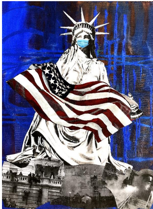
Sueim Koo, American Pietà , 2021 Mixed media collage with newspapers & acrylic on canvas, 24" x 18"